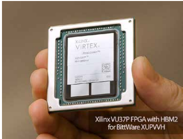
Xilinx VU37P FPGA: lidless package is used by BittWare's Viper thermal management for enhanced cooling performance